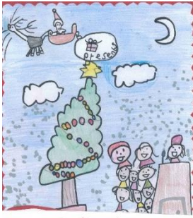
Acton Christmas Lights 2021! 29th November from 4pm at Queensway Green, then on to the village hall for refreshments.